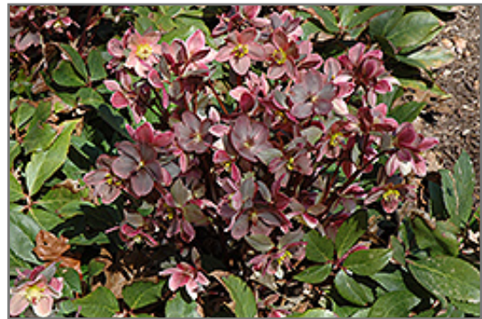
Pink Frost Hellebore in bloom