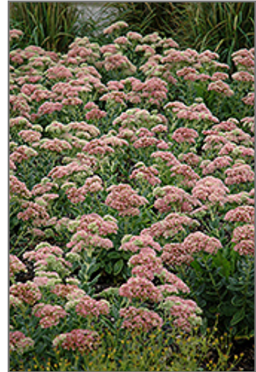
Autumn Joy Stonecrop in bloom

Autumn Joy Stonecrop is recommended for the following landscape applications;