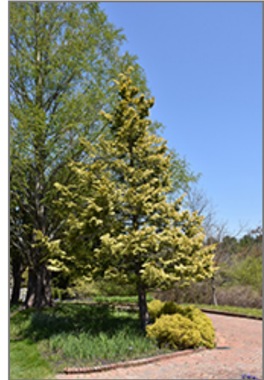
Cripps Gold Falsecypress

* This is a 'special order' plant - contact store for details