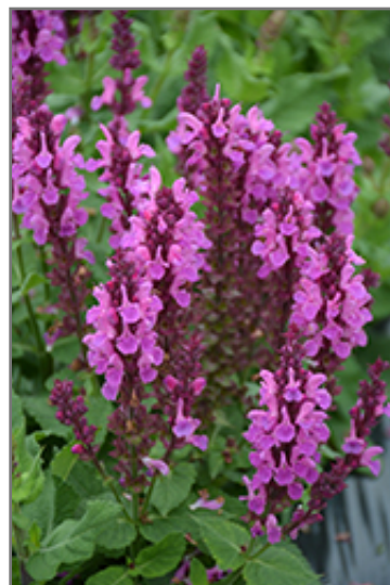
Rose Marvel Meadow Sage flowers

Rose Marvel Meadow Sage is recommended for the following landscape applications;