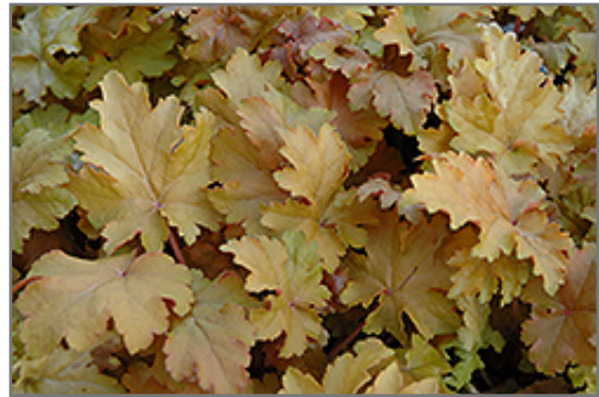
Amber Waves Coral Bells foliage

Amber Waves Coral Bells will grow to be only 6 inches tall at maturity extending to 12 inches tall with the flowers, with a spread of 12 inches. When grown in masses or used as a bedding plant, individual plants should be spaced approximately 10 inches apart. Its foliage tends to remain low and dense right to the ground. It grows at a medium rate, and under ideal conditions can be expected to live for approximately 10 years. As an evergreen perennial, this plant will typically keep its form and foliage year-round.