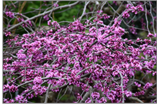
Traveller Weeping Redbud flowers