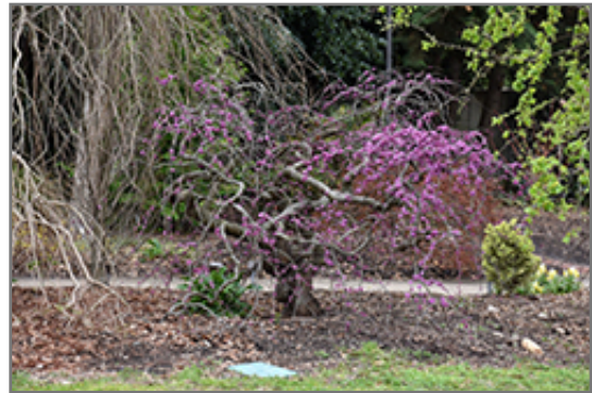
Traveller Weeping Redbud in bloom