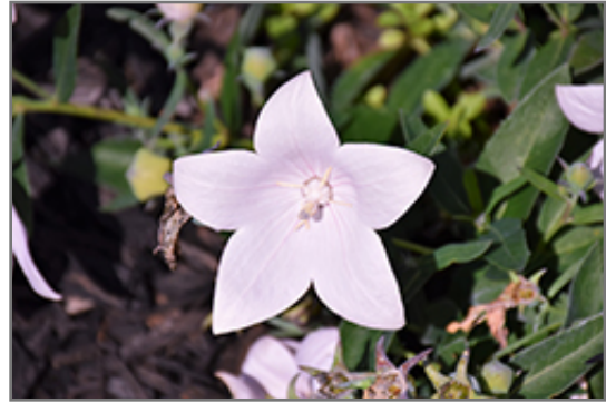
Pop Star Pink Balloon Flower flowers

Pop Star Pink Balloon Flower is recommended for the following landscape applications;