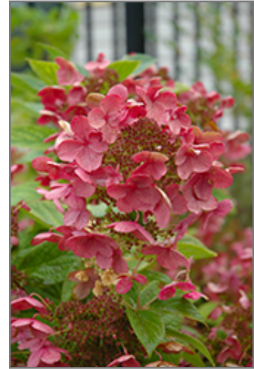
Quick Fire Hydrangea flowers (faded)

This shrub performs well in both full sun and full shade. It prefers to grow in average to moist conditions, and shouldn't be allowed to dry out. It is not particular as to soil type or pH. It is highly tolerant of urban pollution and will even thrive in inner city environments. Consider applying a thick mulch around the root zone in winter to protect it in exposed locations or colder microclimates. This is a selected variety of a species not originally from North America.