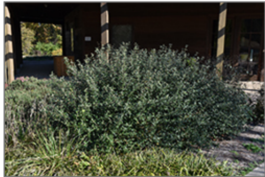
Prague Viburnum