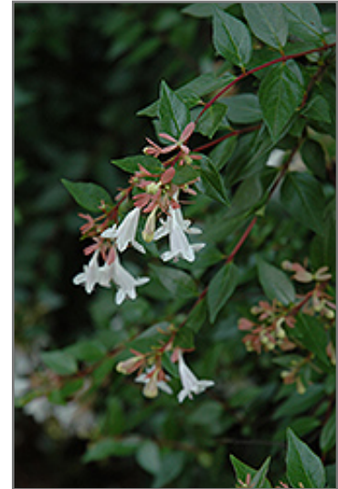
Edward Goucher Abelia flowers

Edward Goucher Abelia is recommended for the following landscape applications;