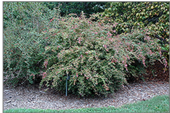
Edward Goucher Abelia in bloom