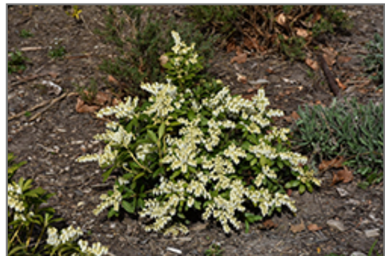
Cavatine Dwarf Japanese Pieris in bloom